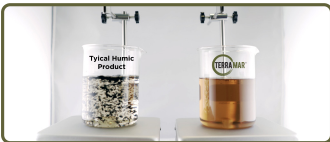
1% Dilution of TERRAMAR in CaTs compared to 1% Dilution of a typical 10% Humic Acid product